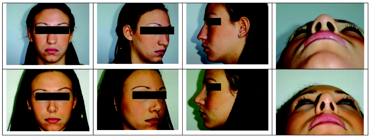
Picture 9. A 22-years old lady admitted in our department with severe nasal obstruction, wide dorsum, bulbous, underprojected and underotated tip, slight hump. She underwent open rhinoplasty: 1) Hump removal and medial oblique and lateral osteotomies with guarded microosteotome 2,5 mm 2) Septoplasty via the columellar incision 3) Dorsal onlay autologous graft (septal cartilage) 4) removal of a strip from the caudal septum and a part of the anterior nasal spine 5) Columella strut 6) transdomal and interdomal sutures 7) columella onlay graft. Preoperative and postoperative pictures 1 year later

Picture 8. Columellar strut and transdomal-interdomal sutures